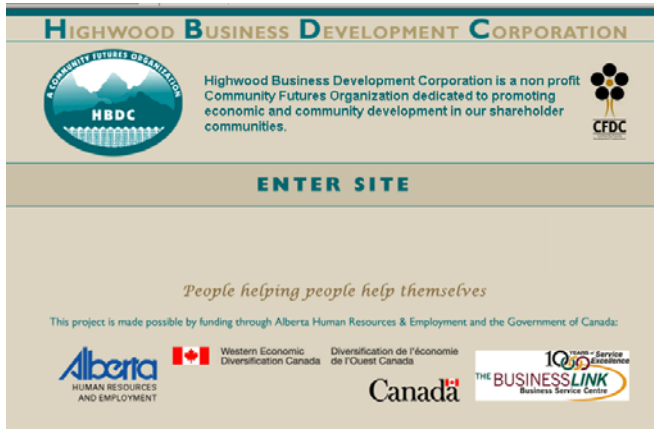
Community Futures Highwood www.hbdc.net/splash