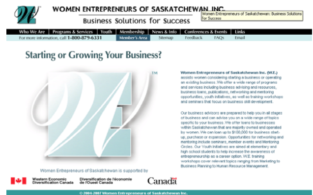
Women Entrepreneurs of Saskatchewan www.womenentrepreneurs.sk.ca